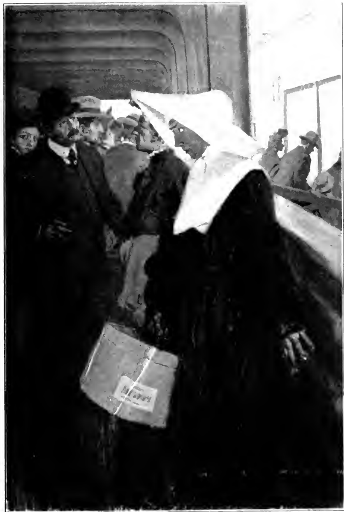
"He's a sack one, we hear, and may be worth a little to the cause."